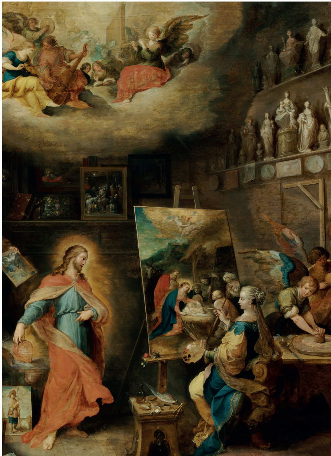
Frans Francken II Christ in the Studio (Pictura Sacra (detail)) ca. 1616-1620