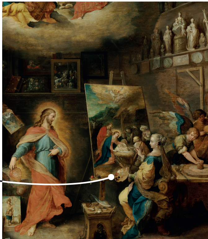
Frans Francken II Christ in the Studio (Pictura Sacra) (detail) ca. 1616-1620